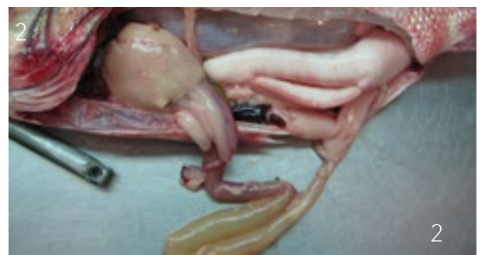
Picture 1 and 2: Clinical signs of vibriosis. In Picture 1 red spots on skin, in base of fins, around gills and mouth are seen. In Picture 2 we see fluid in intestine and petechial bleeding in internal organs.