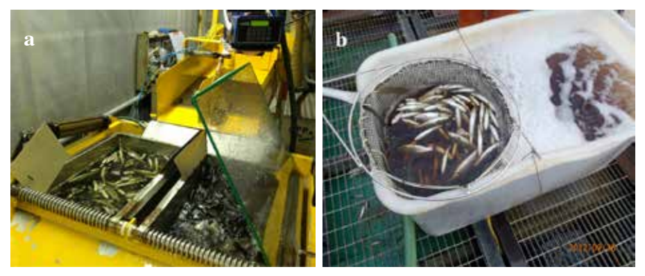
Figure 2. a) automatic, and b) manual anaesthetisation of salmon parr.

In the former case it is important that the operator is familiar with the ionic buffering capacity of the local water. In poorly buffered or soft water, TPQ can cause a significant drop in the pH, which not only acts as a potential stressor to fish but can also result in hitherto benign metal ions suddenly becoming toxic, as well as the inducement of other undesirable physiological changes. It is important to remember that pH is measured on a log scale, so the difference between pH 7 and 6 represents a ten-fold increase in hydrogen ions.