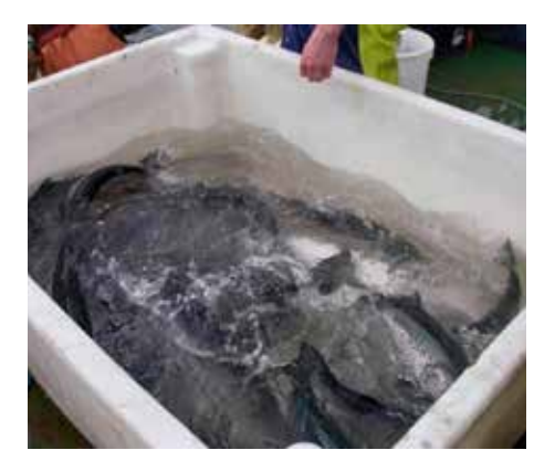
Figure 3. Anaesthetisation of large fish in seawater for lice counting.

To overcome this it may be necessary to buffer the water in the anaesthetic bath through the addition of an agent such as sodium bicarbonate (also available from PHARMAO). The need for and extent of buffering will be best determined by monitoring pH, which should always be maintained at ambient. By and large, adequate buffering can be achieved by matching, weight for weight, the amount of TPO with sodium bicarbonate. It is worth bearing in mind that the potency of TPQ increases as temperature rises and water hardness falls.